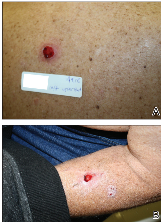
FIGURE 1. A and B, Electrodesiccation and curettage sites on the left side of the upper back and left forearm with hypergranulation that was refractory to routine wound care and topical silver nitrate application.

We initiated treatment with topical timolol in a patient who developed hypergranulation at 2 separate electrodesiccation and curettage sites that was refractory to 6 weeks of routine wound care with white petrolatum under nonadherent sterile gauze dressings and 2 subsequent topical silver nitrate applications (Figure 1).